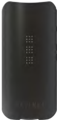
IQ2 shown in Smart Path 3